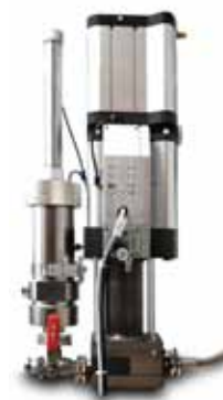
Dos A90 B / Pressure-booster

The A90 B is adaptable to different sizes of cartridges and suits for highly viscous and filled cast resin.