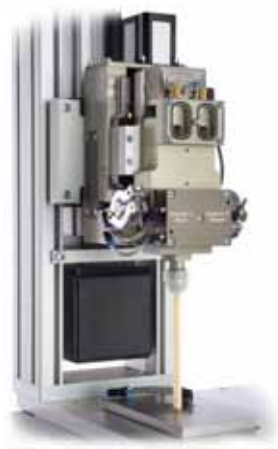
Piston Dispenser: Dos P016-2C/01

Further advantages: equipped with robust mechanical driving components, precision motor, linear guides and integrated metering monitoring sensors.