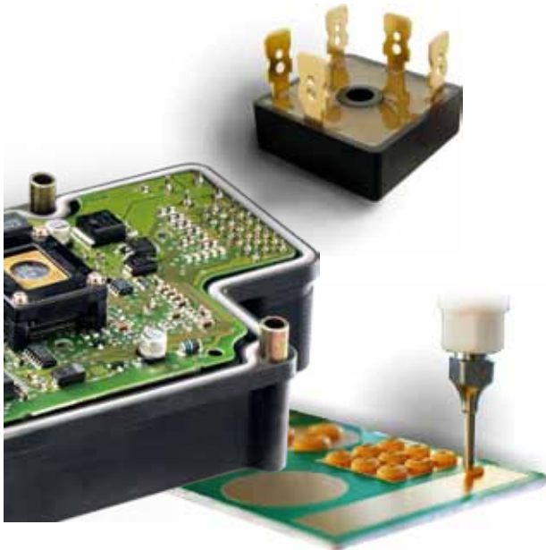
Applications: dispensing and potting of cast resin

Unbeatable price-performance ratio, extremely compact desktop solution, but no compromise on precision in metering quantity and mix ratio.