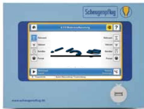
Scheugenpflug Microcomputer Controller SCP200

The intuitive microcomputer controller works PC based and provides full-graphics display of information. All functions are covered from feeding and metering unit up to the dispensing task. The control unit makes it easy to fulfil monitoring, maintenance and analysis tasks and thus helps the operator to perform all production processes quickly and flawlessly. It is easy to set up, which allows for quick adaptation on site. On the comfortable and easy-to-use 7" touch screen display the operator can enter and access all programmes in various languages. The display has been designed with user requirements in mind and is based on DIN ISO 9241 standards. Therefore, all process relevant data are readily available on the main menu level. A flat menu structure with very few navigation levels provides quick and easy access to all parameter settings.