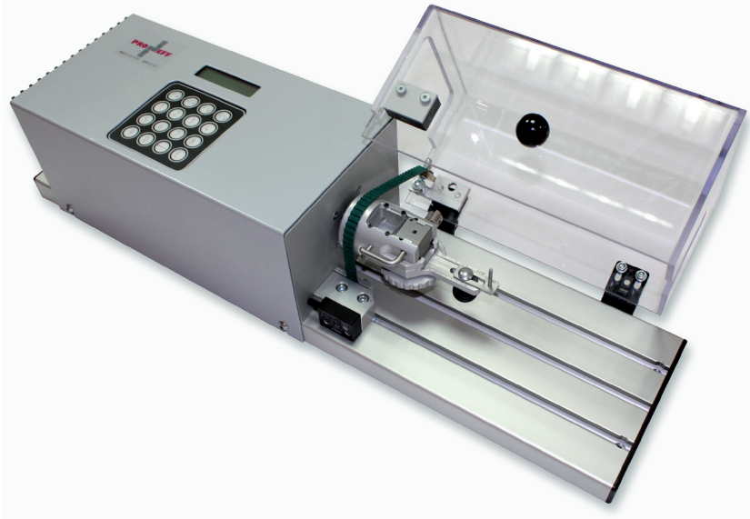
PRO Twist Basic A/B

TWISTING OF SINGLE STRANDS – NOW ALSO AVAILABLE WITH THE LATEST PNEUMATIC TENSION FORCE AND STRAIN RELIEF