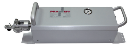
B: Pneumatic tension force