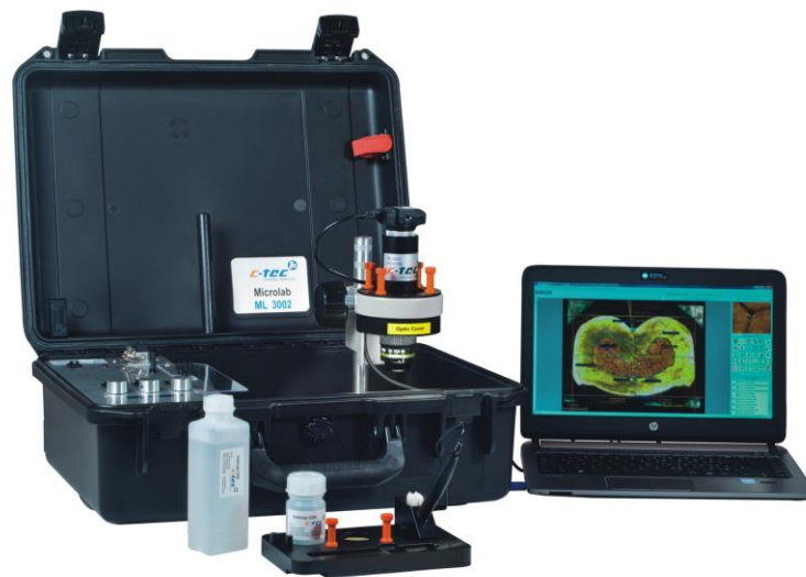
Microlab ML3002 in operation

Portable laboratory to prepare crimp cross sections analysis