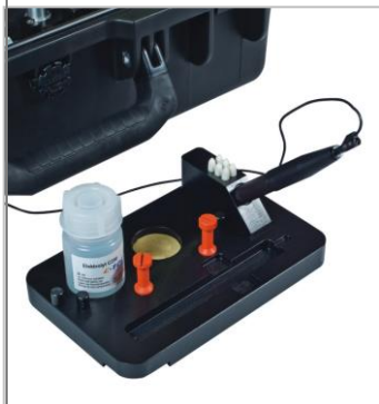
Polishing liquid free of hazardous substances