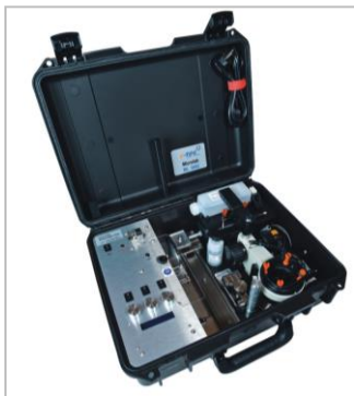
ML in rugged case made of HPX High Performance Resin