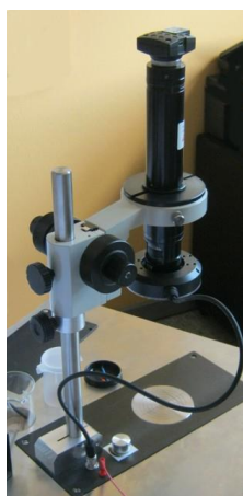
Optic with camera