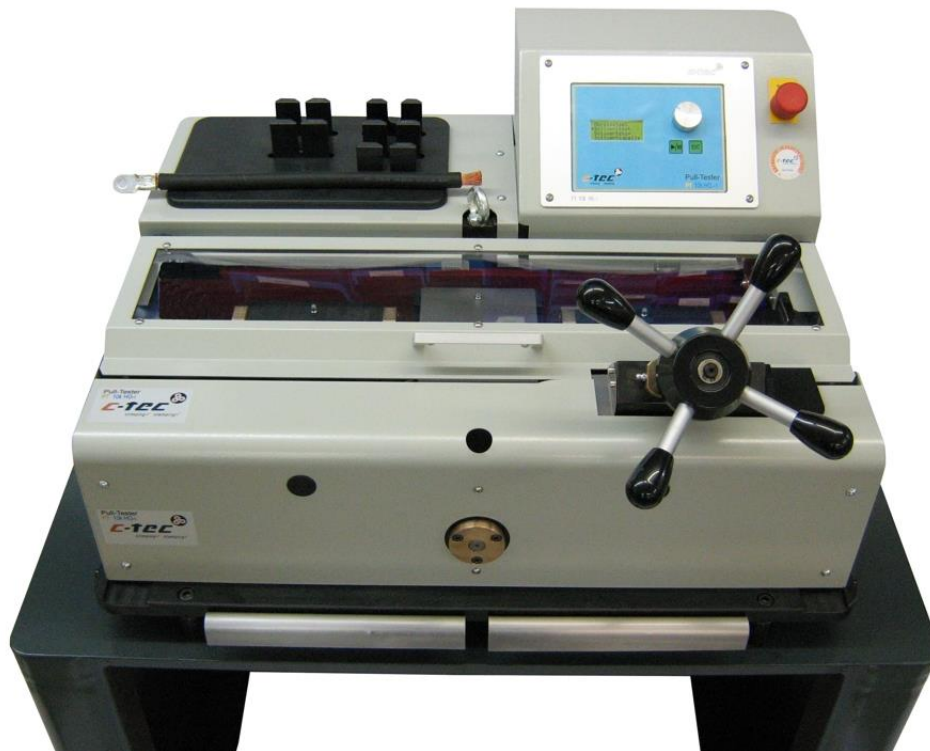
Pull Tester PT10k HG-i

Motorised Gauge for tensile tests – heavy design for large crimp connections