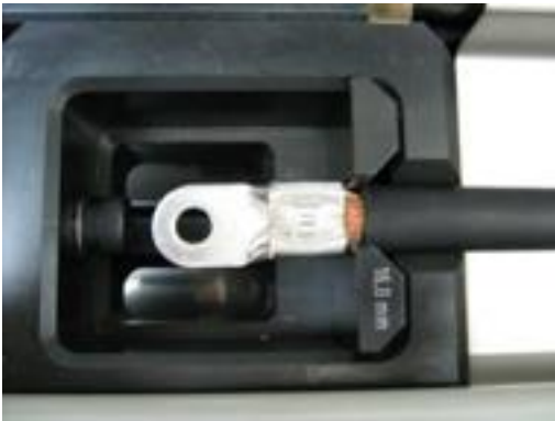
Clamp for terminal